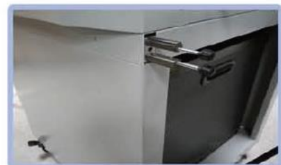
Tools and waste bin