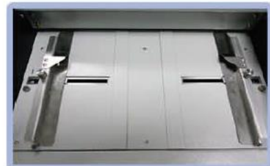
Centre register table with skew adjustment