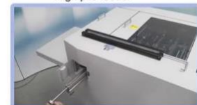
Cross Perforation bar Crease bar