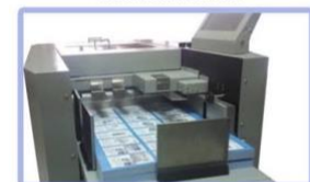
High pile feeder