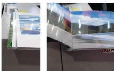
Gap lamination for layflat binding