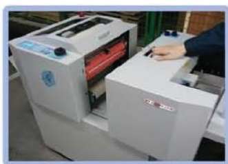
Slide out easy film loading