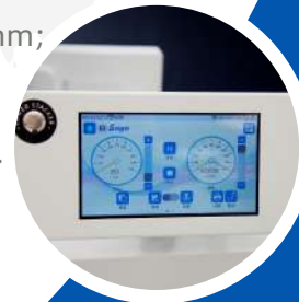
7 Inch Full Touch Screen