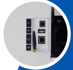
Multiple Connection Methods