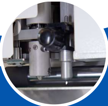
Double Knife Head Design Die-cutting + Indentation